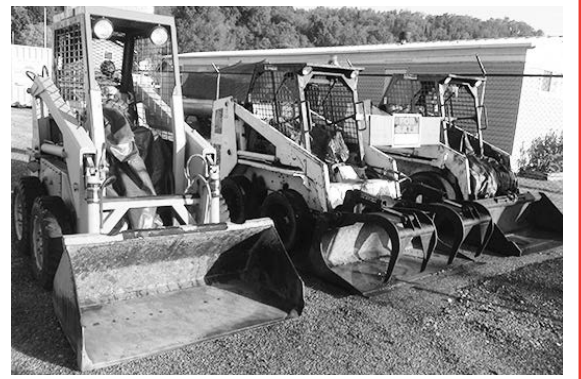
(3) Skid steer ldrs., (2) Bobcat model 743, (1) Case 1740, all in exc. mechanical cond., all dsl. pwr., $7,550 ea. (412) 384-2008

WANTED Mack trucks from '68-'02, R, DM, U, RD, CH & CL models, dump trucks & road tractors, S-A, tdm. & tri-axle. (724) 538-5995 or (412) 596-5578