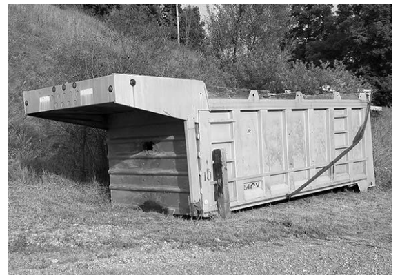
Alum. & steel beds at a fraction of new! (1) Dump trlr., some tractors left, retiring after 30 years of trucking. (304) 457-1695