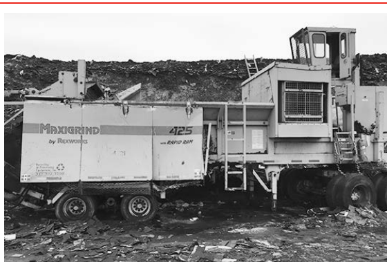
'97 Maxigrind 425 wood grinder, Cat 425 dsl. eng., 3200 hrs., standard width/5th whl. for easy transport, no special permits, operators station telescopes over hopper, simple operation, $54,000 or best offer. (517) 420-2223