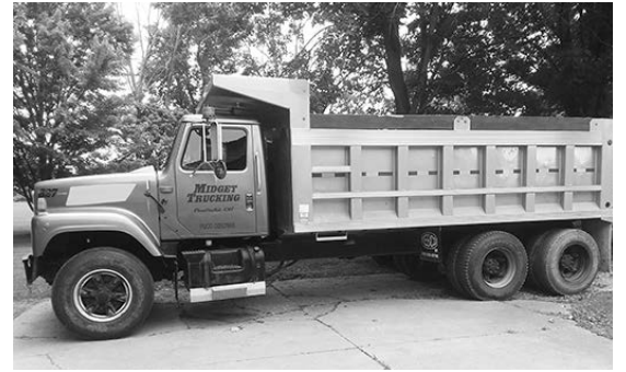
'93 Int'l. tdm. axle dump, complete o'hauled DT466, 270 hp, head bolts down, new Red Dot A/C unit, new exhaust system, new tie-rod ends, dirt liner, (2) new steer tires & more, exc. cond., asking $30,000. Wellington, OH (440) 225-2782