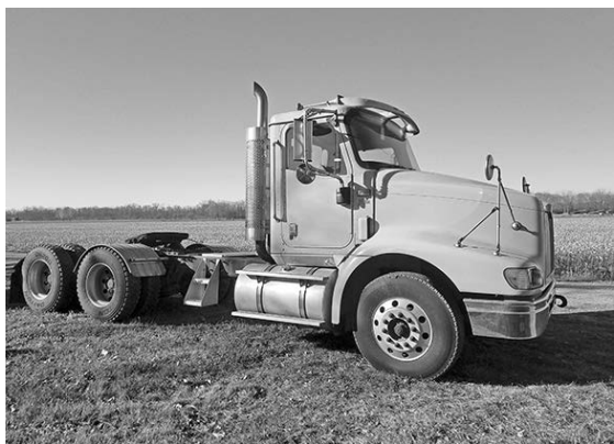
05' 9200i, Cat C13, alum. rims, 13 spd., 191" WB, PTO, new tires, 280,000 miles, $32,000 or best offer. (937) 605-2487

General construction equipment, backhoes, trenchers, trucks, light boards, directional drill equipment. (330) 352-8053