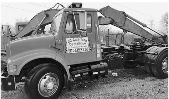
'97 Int'l. hook truck, DTT466 dsl., 6 spd. trans., w/(5) roll-off boxes, 12-yd. boxes, $32,000. (614) 206-3386