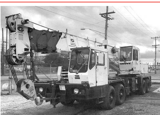
'88 Grove 40-ton hyd. crane TMS-300-B, 6247 eng. hrs., 2299 PTO hrs., 35,281 miles, unit is in exc. cond., needs paint, $48,500. (412) 384-2008

'80 R model Mack 686 series C&C, Mack 350 eng., Fuller 13 spd., 18F & 44 camel hump rears w/ diff. lock extra trunion, make offer. (330) 754-8426