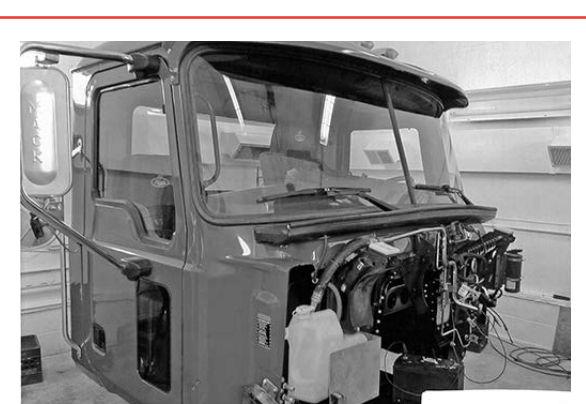
Mack cabs & hoods, new & used, CH-CHU-Granite CV713-GU, some full dressed cabs, '08 & up instrument clusters, MP8 eng., MP7 eng. parts. (304) 288-1678