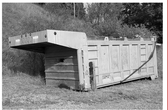
Alum. & steel beds at a fraction of new! (1) Dump trlr., some tractors left, retiring after 60 years of trucking. (304) 457-1695