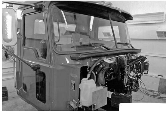
Mack cabs & hoods, new & used, CH-CHU-Granite CV713-GU, some full dressed cabs, '08 & up instrument clusters, MP8 eng., MP7 eng. parts. (304) 288-1678