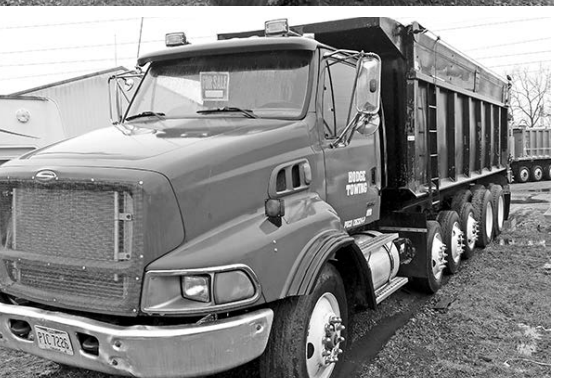
'99 Ford Sterling 6-axle dump truck, heated bed, auto. tarp, $42,000 firm. (614) 206-3386