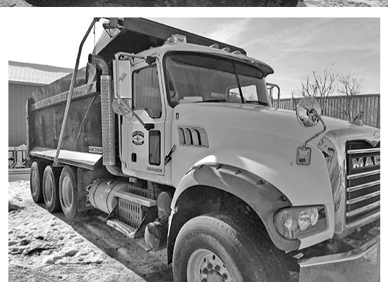
'08 Mack Granite GU713 dump truck, American dump body, MP7 eng., 395 hp, T310M trans., pintle hitch, 202,000 miles, $74,000. (765) 674-8188