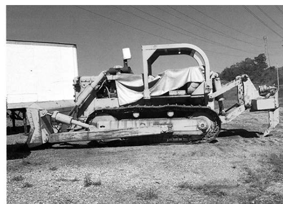
(2) IH TD-25C, (1) w/ripper & (1) w/out, exc. engs., trans., U/C's, blades, cutting edges, very good running dozers, $15,500 ea. (412) 384-2008