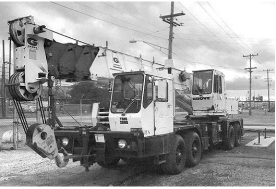
'88 Grove 40-ton hyd. crane TMS-300-B, 6247 eng. hrs., 2299 PTO hrs., 35,281 miles, unit is in exc. cond., needs paint, $48,500. (412) 384-2008