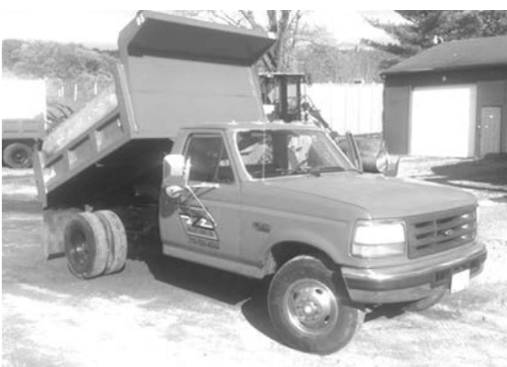
'98 Ford F350, 8' PTO dump, 5.8L V8, 5 spd., tow hitch, 92,050 miles, $8,150. (216) 524-4544