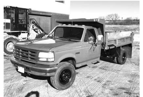
'93 Ford F450, 10' dump, 7.3L dsl., 261,160 miles, 5 spd., pintle hitch, good tires & brakes, work ready, $8,800 negotiable. (216) 524-4544

95 Gal. alum. tank, $500. 13 Spd. trans., $3,500. Wetline complete w/ tank, $2,500. Stainless air cleaner, $350. ISX Cum. for rebuilding, $4,500. R&L doors, $500 ea. Will accept any offers, shipping available. (330) 936-0705