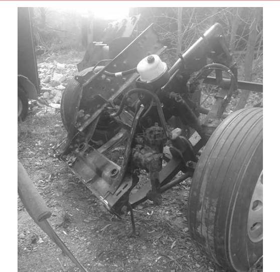
Eaton air-ride cut-offs w/ rims & tires, $3,500. (330) 936-0705

WANTED Mack trucks from '68-'02, R, DM, U, RD, CH & CL models, dump trucks & road tractors, S-A, tdm. & tri-axle. (724) 538-5995 or (412) 596-5578