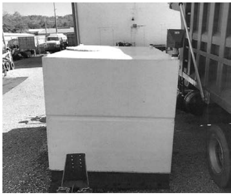
Steel fuel tank, manufactured by Highland, heavy steel tank, approx. 1/4" thick, plate 10'10" long, 6'6" wide, 6' tall, sits on (2) 12" H-beams, approx. 3100-gal., in building since new, $4,450. (412) 384-2008