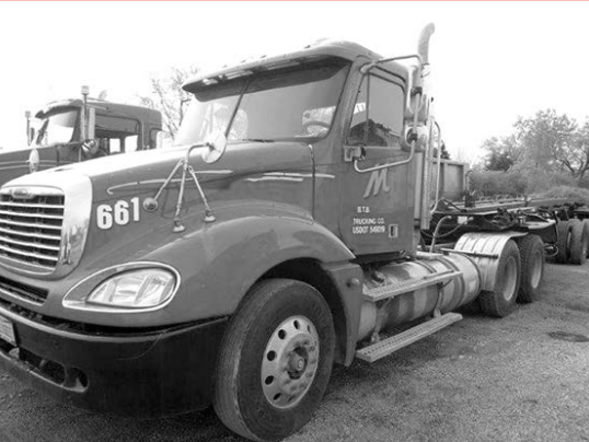
'05 FTL CL120, Mercedes MB4000, 10 spd., 195" WB, 3.58 ratio, 11x22.5, (2) hose wet line, roll-off ready. (216) 441-3070

WANTED Mack trucks from '68-'02, R, DM, U, RD, CH & CL models, dump trucks & road tractors, S-A, tdm. & tri-axle. (724) 538-5995 or (412) 596-5578