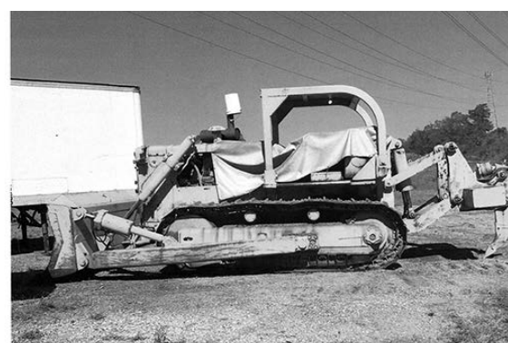
(2) IH TD-25C, (1) w/ripper & (1) w/out, exc. engs., trans., U/C's, blades, cutting edges, very good running dozers, $15,500 ea. (412) 384-2008