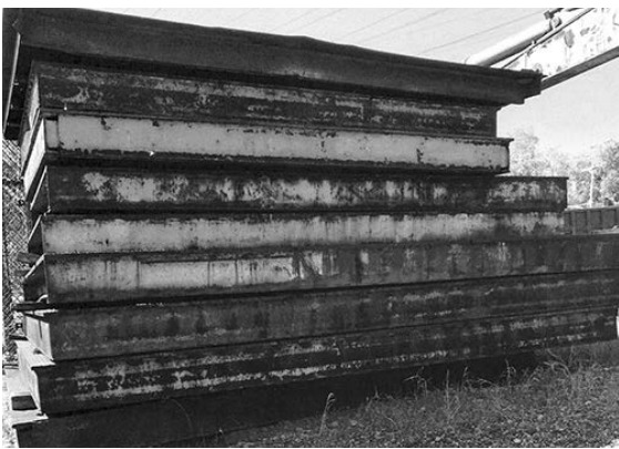
Deck plate w/8" H-beams on frame, (1) 10'10"x9'11"x8" frame, (3) 11'2"x11"x8" frames, (2) 11'9"x7'5"x8" frames, (1) 8'4"x9'11"x8" frame, (1) 8'x9'11"x8" frame, all check plates are approx. 7/8" thick, all steel beams are 8" H-beams, take all $16,200. (412) 384-2008