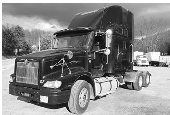
'05 Int'l. 9400, ISX Cum., 500 hp, 10 spd., APU, 11x22.5 LP. (330) 204-1464