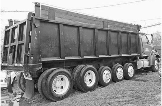
'99 Ford Sterling, 6-axle heated bed, 21', N14 Cum., 8 spd. trans., $42,000. (614) 206-3386