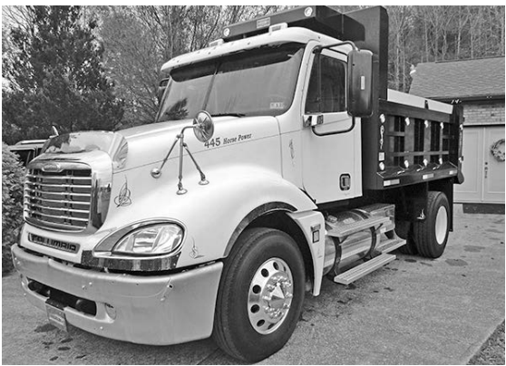
'05 & '06 FTL Columbia, tremendous power, brand new dump beds, 12.7L Det., 445 hp, great cond., $45,000 ea. Great Price! Call for info. (304) 765-5314