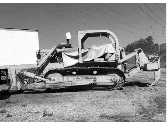
(2) IH TD-25C, (1) w/ripper & (1) w/out, exc. engs., trans., U/C's, blades, cutting edges, very good running dozers, $15,500 ea. (412) 384-2008