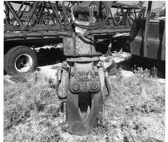
Rotating grapple bucket, pin size to main boom is approx. 2-1/2" in diameter, used cond., $3,500. (412) 384-2008