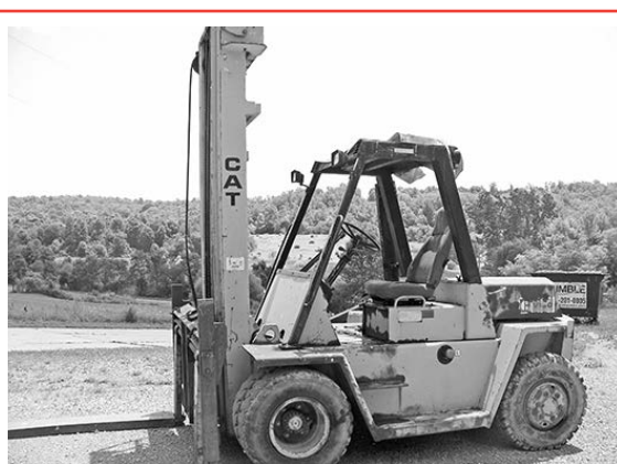
Cat 13,000# forklift, Perkins dsl., side shift, 4' forks w/8' ext., good cond., $12,000 or best offer. New Philadelphia, OH Area (330) 339-4780 (330) 204-2176