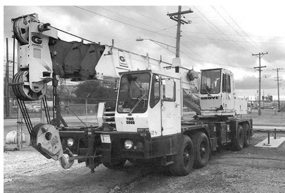
'88 Grove 40-ton hyd. crane TMS-300-B, 6247 eng. hrs., 2299 PTO hrs., 35,281 miles, unit is in exc. cond., needs paint, $48,500. (412) 384-2008

General construction equipment, back-hoes, trenchers, trucks, light boards, directional drill equipment. (330) 352-8053