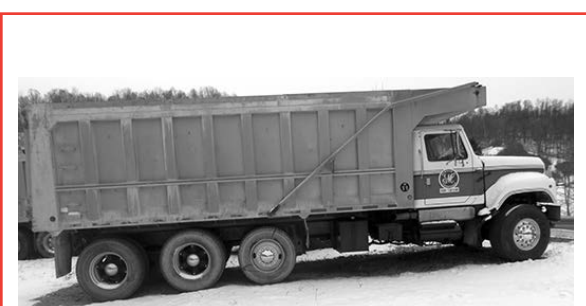
'00 Int'l. tri-axle, N14 Cum. Select, 525 hp, Jake, 18 spd., 46 Rockwell, some tractors left, (1) dump trlr., retiring after 60 years of trucking. (304) 457-1695