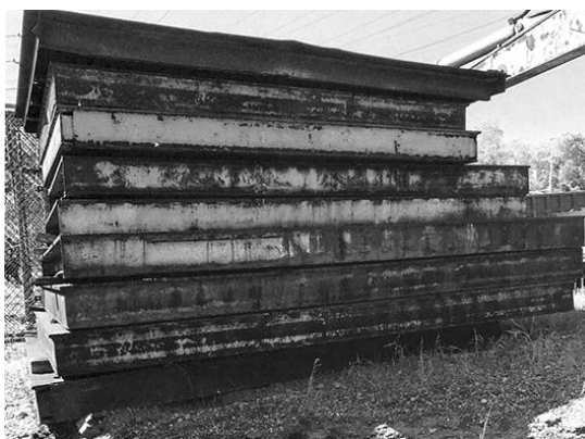
Deck plate w/8" H-beams on frame, (1) 10'10"x9'11"x8" frame, (3) 11'2"x11'x8" frames, (2) 11'9"x7'5"x8" frames, (1) 8'4"x9'11"x8" frame, (1) 8'x9'11"x8" frame, all check plates are approx. 7/8" thick, all steel beams are 8" H-beams, take all $12,600. (412) 384-2008