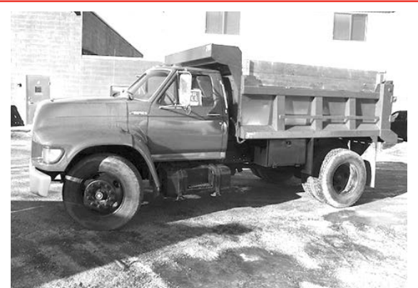
'98 Ford F800, 10' dump, 5.9 dsl., 5/2 spd., 26,000 GVW, hyd. brakes, $14,300. (216) 524-4544