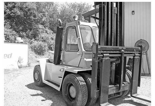
Cat 25,000# forklift, Cat dsl., side shift, 8' forks, good cond., $25,000 or best offer. New Philadelphia, OH Area (330) 339-4780