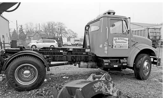
'97 Int'l. hook truck, 6 spd., comes w/ (3) open 12-yd. boxes & (2) closed top 12-yd., $32,000. (614) 206-3386