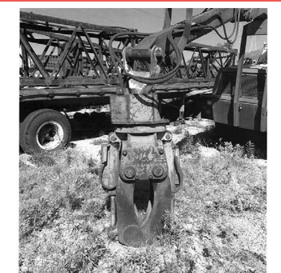
Rotating grapple bucket, pin size to main boom is approx. 2-1/2" in diameter, used cond., $3,500. (412) 384-2008