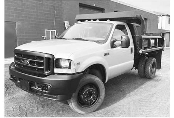
'04 Ford F450, 9' PTO dump, 6.8L V10, 119,190 miles, fresh paint, new floor in dump, 6 spd. manual, pintle hitch, $15,975.