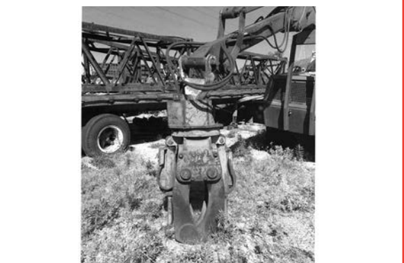
Rotating grapple bucket, pin size to main boom is approx. 2-1/2" in diameter, used cond., $3,500. (412) 384-2008

'11 East Genesis 33' on 34'x96" w/66'd, 11R22.5 alum., roll tarp, 2-way gate, man door, air ride w/lift, good tires, brakes & floor, $31,500. (330) 507-6713