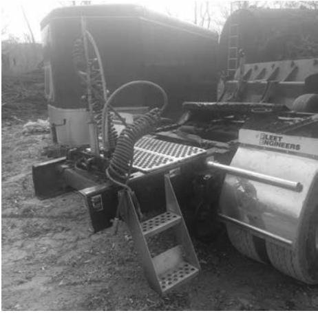
Parts from '14 KW W900. (330) 936-0705