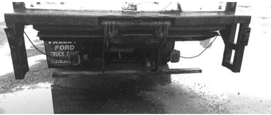
'96 Ford F70 box truck, 429 gas eng., manual trans., pwr. lift gate, priced to sell. (234) 808-4316