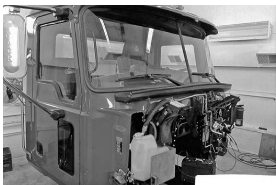
Mack cabs & hoods, new & used, CH-CHU-Granite CV713-GU, some full dressed cabs, '08 & up instrument clusters, MP8 eng., MP7 eng. parts. (304) 288-1678