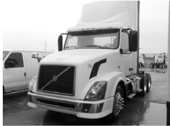
2013 VNL64T300, D13, 425 hp, Eaton Fuller 10 spd., day cab, #5170.