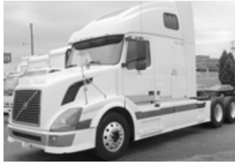
'04 Volvo VNL64T-670, VED12, 465 hp, 10 spd. O.D., 3.58 ratio, tilt, loaded, (10) alum. whls., only 633K miles.