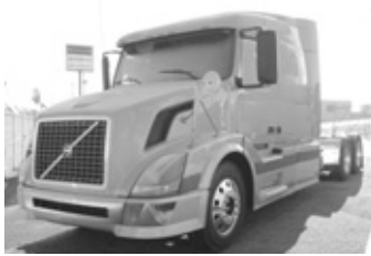
'05 Volvo VNL64T-630, VED12, 465 hp, 10 spd. O.D., 3.73 ratio, tilt, CD, (2) air seats, (10) alum., loaded, blue metallic.