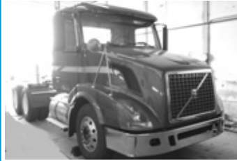
2005 Volvo VNL64T, Cum. ISX 400 hp, C-brake, FRO16210C, 178" WB, painted blue, only 432K miles.

Young Volvo Offers Road Service Assistance -AND- Trailer Repair Service ROAD SERVICE 24/7 Call (800) 308-0838 CALL LINE OPEN 24 HOURS! EVERYDAY!