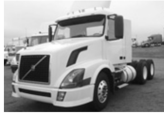
'05 Volvo VNL64T, VED 12, 435 hp, Jake, 10 spd. O.D., 174" WB, 3.90 ratio, only 434K miles.