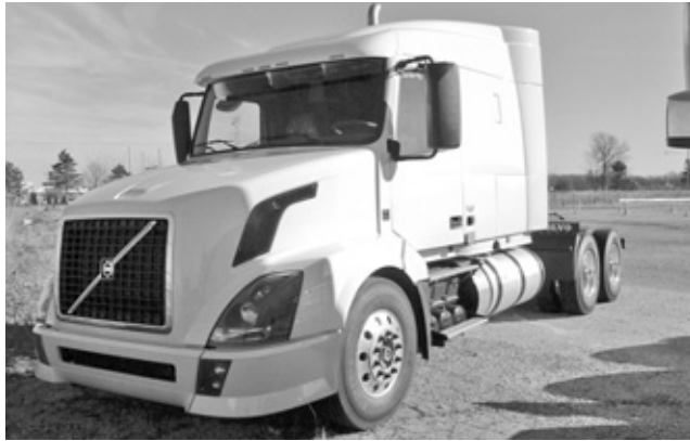
2012 VNL 630, 61" midroof, D13 455 hp, I-shift trans., #5163.