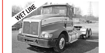
Det. 60, 12.7, 470 hp, 10 spd., 12F, 40R, w/wet line, ready to work. . . . . $12,500