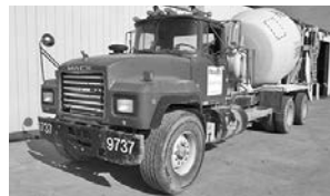
RD 688 Mack, 350 hp, 8LL, 44R, 11-yd. mixer w/stinger, low miles. . . . . $18,900 ea.