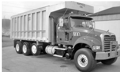
Mack MP8 455-M, 18 spd., 58R, 21' alum. box, 200,000 mile average, $62,500.