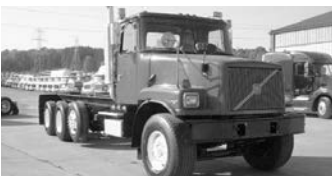
Cum. 370 hp, 8LL, 46 lockers, 18F, good dump chassis . . . . . Choice $16,500