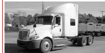
slpr., MaxxForce, 430-470 hp, 10 spd., low mileage - 250,000-430,000 . . From $14,950