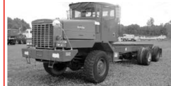
6x6 C&C, Cum. M11 & L10, 8LL, 40R & 46R . . . . . From $15,900