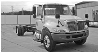
Int'l. dsl., 6 spd., S/A, LWB . . . . . $8,750 Also: (6) Other C&C's.