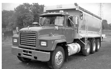
Mack 400 hp, dsl., Jake, Fuller 8LL, 18F, Mack 44R air ride, 17' alum. 1/2 round dump bed, alum. whls., clean trucks, Choice $34,500.