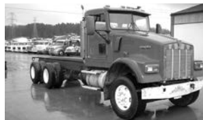
T800, low miles, Cum. 375 hp, 8LL, 46R lockers . . . . . From $18,500