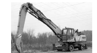
• Model 825M, Deutz, 210 hp, w/generator $71,500 • Liebherr A904 rubber tire material handler