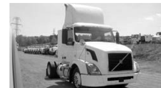
Cum. ISX, 400 hp, 10 spd., 23R . . . . . $8,450