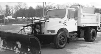
'99-'02, DT466, auto. & 6 spd., S/A, 9' bed, pwr. angle plows . . . . . From $9,500.