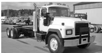
E7 350 hp, 8LL, 44R. . . . . Choice $17,900