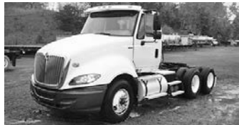
MaxForce 430 hp, 10 spd., tdm. axle, 300,000 miles. . . . . SPECIAL $15,900