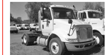
MaxxForce 13L, 410 hp, 9 spd., S/A, low miles. . . . . From $11,500 ea.