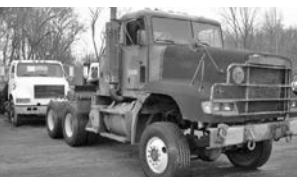
• (2) FTL 6x6, Det. 12.7L . . . . . $29,500 ea. • (3) M920, 6x6, Cum. 400 . . . . . $18,500 ea. • (5) Mack tdm. R-Models . . . . . Call