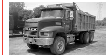
'90-'91 Mack, manual eng., 8LL, Mack rears, steel 15' & 16' bodies. . From $9,750