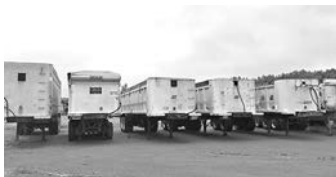
28'-32' Alum. high side, East, Frue., City, Allison, tdm., tri, ready to work . . . . . Call for details