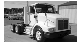
Cum. ISX, 450, 10 spd., 40R, air ride, good tires, SPECIAL $12,750.