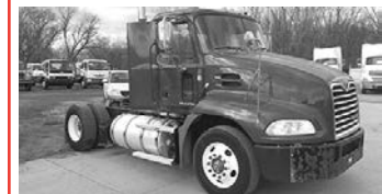
Mack MP-7, 10 spd., 23R . . . From $10,500