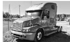
Det. & Cat eng., 10 spd., 40R, air ride . . . . . From $9,500