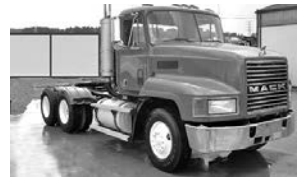
'00-'05, some w/wet lines, Mack 300-400 hp, tdm. . . . . Call for details